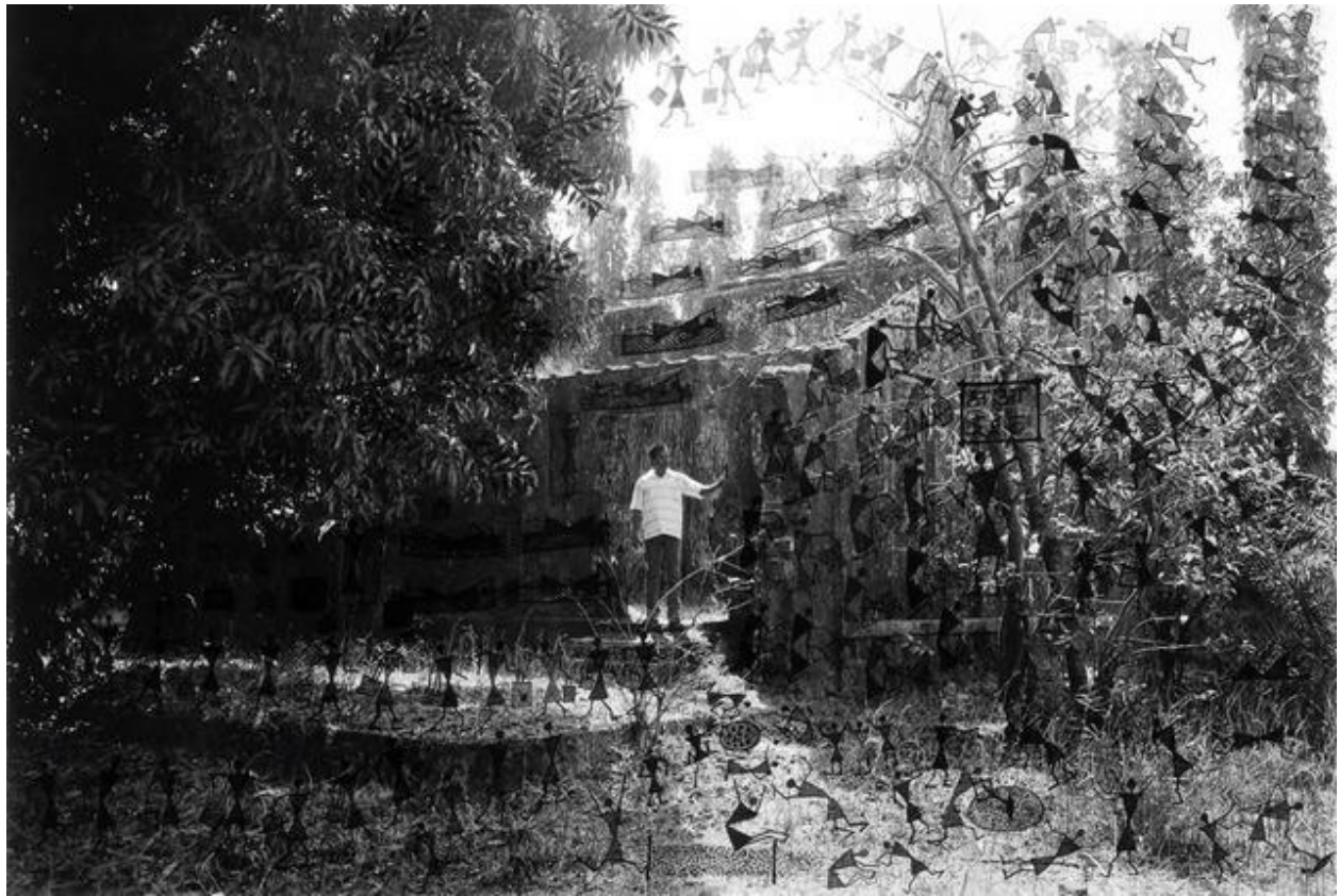
Gauri Gill and Rajesh Vangad, Orphanage Days, from “Fields of Sight”, 2014, ink on archival pigment print, © Gauri Gill and Rajesh Vangad, courtesy the artists.

Vangad’s prolific and intense figures make demands on the viewer. Warli iconography and landscape photographs merge in a critical language that remakes each medium. We must not remember the lost landscape in terms of pristine worlds, picturesque lands, “natural” worlds empty of people not lost through the coming of other people, but rather through the narratives and worlds of those who have been displaced, seen as non-modern, unfit to be part of the modern state. There were other worlds, Vangad and Gill tell us, other people, other lives and stories.. They are there, not gone, not past. Vangad is in the landscape, not simply of it. The photograph captures him in the place that is his own, but the language of the photograph is not the only one that can speak for him.