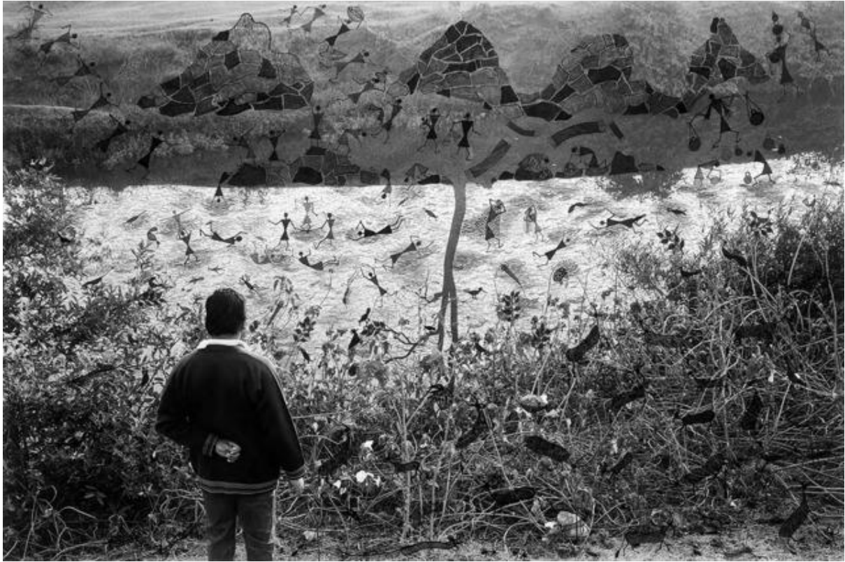
Gauri Gill and Rajesh Vangad, Life by the Water , from "Fields of Sight", 2014, ink on archival pigment print, © Gauri Gill and Rajesh Vangad, courtesy the artists.

At the same time as Vangad and Gill embed their new form within a historical Indian practice of the painted photograph, they depart from it as well. Refusing to paint over with color the black-and-white photograph, they paint with the same palette but with different intensities, languages, shades, and figures. There are no brilliant colors here. What draws the eye are the somber shades of black and white and the combination (not melding) of divergent styles and languages.