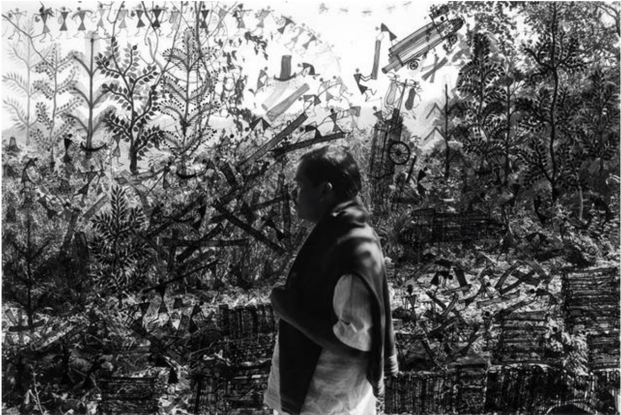
Gauri Gill and Rajesh Vangad, Destroying the Forest , from "Fields of Sight", 2014, ink on archival pigment print, © Gauri Gill and Rajesh Vangad, courtesy the artists.

Denuded landscapes, infested and opaque waters filled with sewage and chemical sludge, garbage dumps, abandoned houses and communities have all become the new critical language of environmental photography as political art. The images present us with an aesthetic of the lost landscape, trying to evade the inevitable pleasure of photographic capture or that frisson of pleasure in destruction. Photography's relation to death and time, in Roland Barthes's formulation, became allied to this aesthetic language of ecocriticism. Yet so many of these practices inevitably succumbed to the sublimity of empty landscapes of "nature," or the aesthetic of the picturesque as histories of nostalgia for landscapes that can be controlled (even to look natural). Breaking from this language, Vangad and Gill mix media, languages, stories, modernities in a collaborative project that defeats the reinscription of the history of landscape art and the valorization of an empty construction of "nature" in both painting and photography.