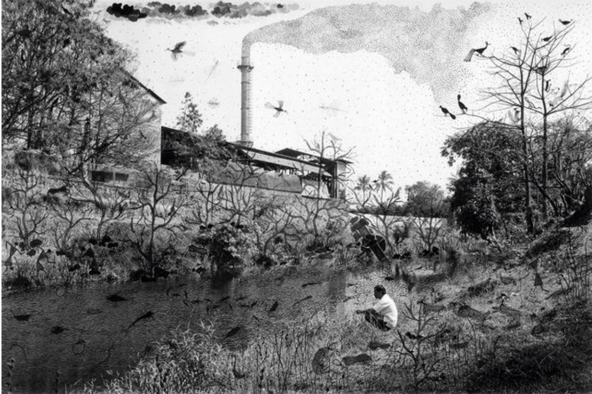
Gauri Gill and Rajesh Vangad, Factory and River , from "Fields of Sight", 2014, ink on archival pigment print, © Gauri Gill and Rajesh Vangad, courtesy the artists.

Once in a while an artistic practice emerges that challenges viewers in new ways that cut through the noise, and offers something both deeply familiar and at the same time utterly new. Collaborative, creative, and experimental, Gill and Vangad, in Fields of Sight , provide a new language for art practices that address the politics and aesthetics of environmental destruction. Ecocriticism comes alive through the conjoining of photography and Warli painting, hoping to replace one modern history with another history, one that is contemporary. If the modern is marked by notions of progress, development, and nationalist discourses of decolonization, the contemporary moment, with its rampant inequalities and environmental destruction, calls for a politics outside of the modernizing narratives of the nation-state.