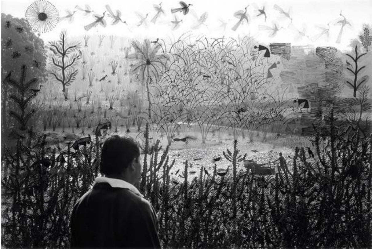
Gauri Gill and Rajesh Vangad, Tilling the Land, from “Fields of Sight”, 2014, ink on archival pigment print, © Gauri Gill and Rajesh Vangad, courtesy the artists.

Vangad and Gill merge the medium of the black-and-white photograph with the more traditional Warli use of figures and icons in white pigment. The starkness of drawing and painting with shades and textures works not simply to disavow modernity or erase it, but also to remind us of its uses and costs — and not why it must not be an end in itself, but rather, why its limits must be recognized.