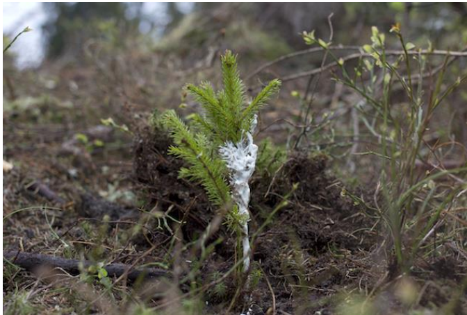
A Future Library sapling

Yes. And, I have to admit, I lived in Iceland for a while and did start to believe in fairies. Well, actually, I got lost in a rock forest—it looked like a forest made of rocks—and I suddenly realized why all these myths and sagas have come out of Scandinavia. These places do feel eerily magical; you can completely believe that there are other imaginary creatures around you.